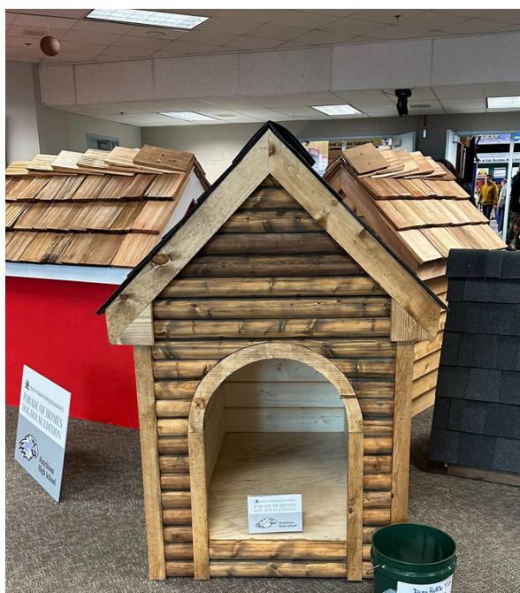
Hutchison High School Winner of AIH People's Choice Award