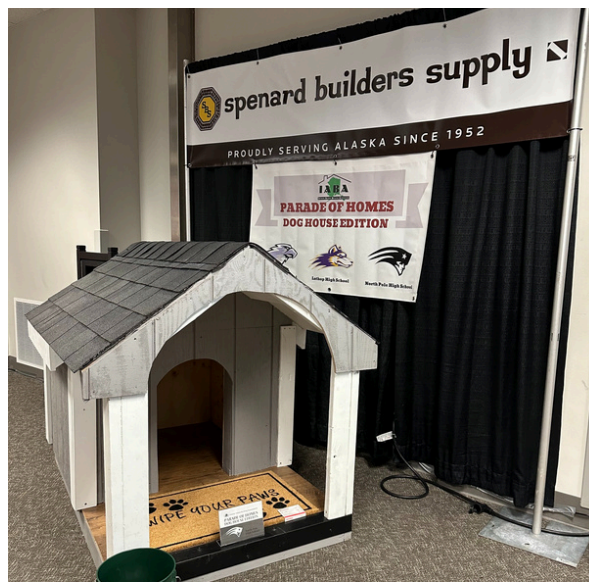
North Pole High School Winner of Mt. McKinley prize of $1500

Thank you for giving back to the community. We are planning the next Parade of Dog Houses for 2026!